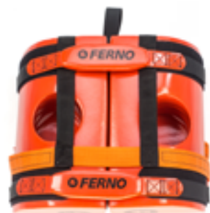
Figure 9 - Storage

The head immobilizer should be cleaned and stored in a dry place indoors, away from direct sunlight. It should be stored as shown when not in use (Figure 9).