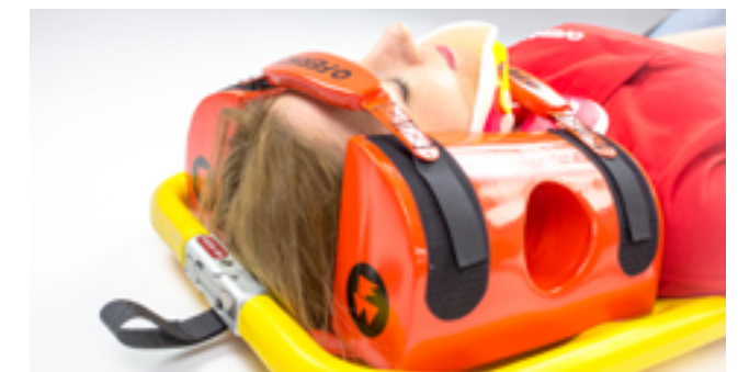
Figure 6 - Placing the patient on the scoop stretcher