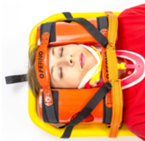
Figure 8 – Head immobilizer correctly applied with the "H" Velcro strap