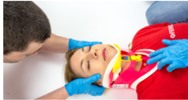
Figure 1 – Cervical Collar Applied

Before applying the head immobilizer, ensure that the cervical collar has been correctly applied on the patient (Figure 1). For use of the cervical collar, consult the relative user manual.