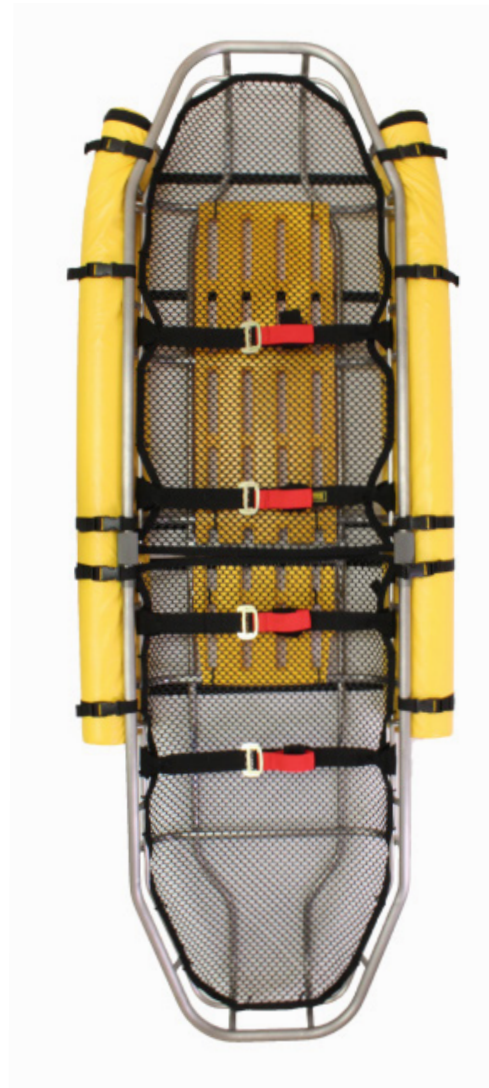
Model 11-0124A..... Flotation Collar, 2 Piece, Yellow